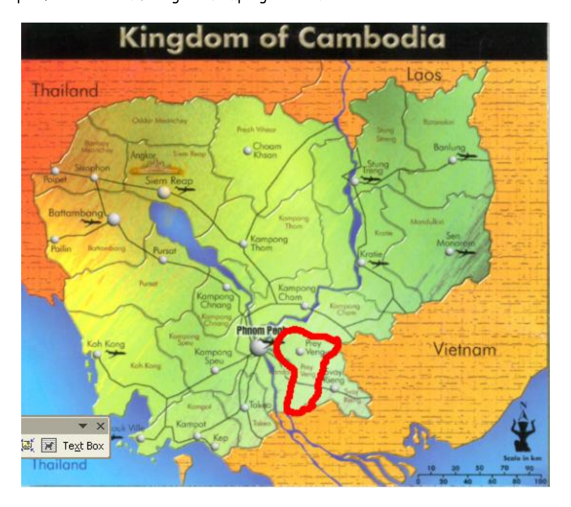
Figure1: Map of Cambodia

The indication shows that more than 50% of woman beggars among the thirty people we have interviewed come from Prey Veng province, and most come from two specific districts: Mesang and Kampong Trabek.